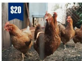
CHICKENS FOR A FAMILY

Click on Join the Team. To donate online, click on Donate Now on the Community Congregational UCC page so that goes to our total dollar amount raised for Amherst.