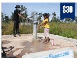
WATER FILTER FOR A HOME