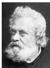
Rev. John Henry Hopkins

One of the hymns we are singing this morning is "We Three Kings of Orient Are". This hymn was written around 1857 by John Henry Hopkins, Jr. who was an American minister and composer. He is especially known for his music contributions to the Episcopal Church. Rev. Hopkins was born in 1820 in Pittsburgh, PA and had 12 siblings. He graduated from the University of Vermont in 1839. In 1863 he published his collection of "Carols, Hymns, and Songs" which had four editions. Hopkins served as the rector of Trinity Church in Plattsburgh, PA and later as rector of Christ Church in Williamsport, PA. He died on January 9, 1868, at age 75.