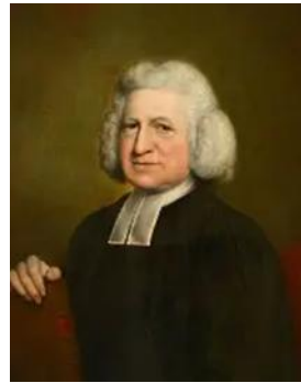
Charles Wesley and his church, "The Foundry"