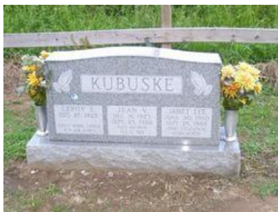
Brownhelm Cemetery, Vermilion